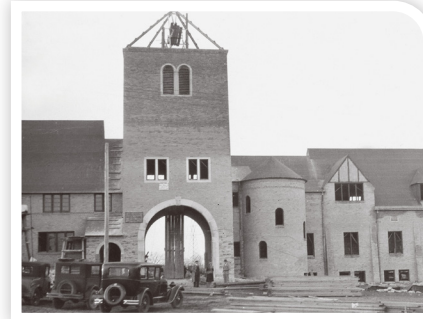
Construction Underway, 1928