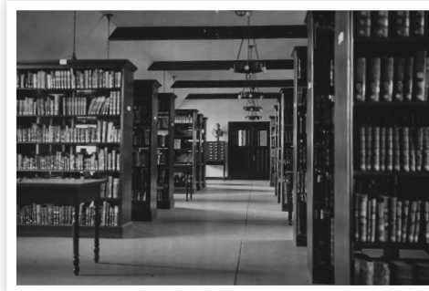
Original Second Floor Library